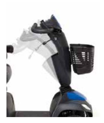
Finite tiller movement

Easily adjustable tiller with stepless adjustments designed steering to enhance steering control. This coupled with the new head tube angle of 70 degrees, help to give more responsive steering control.