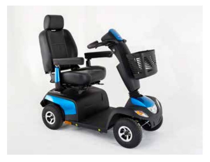
Four wheel Orion METRO